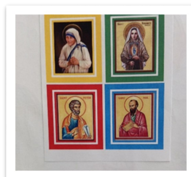
Learning about our House Saints.