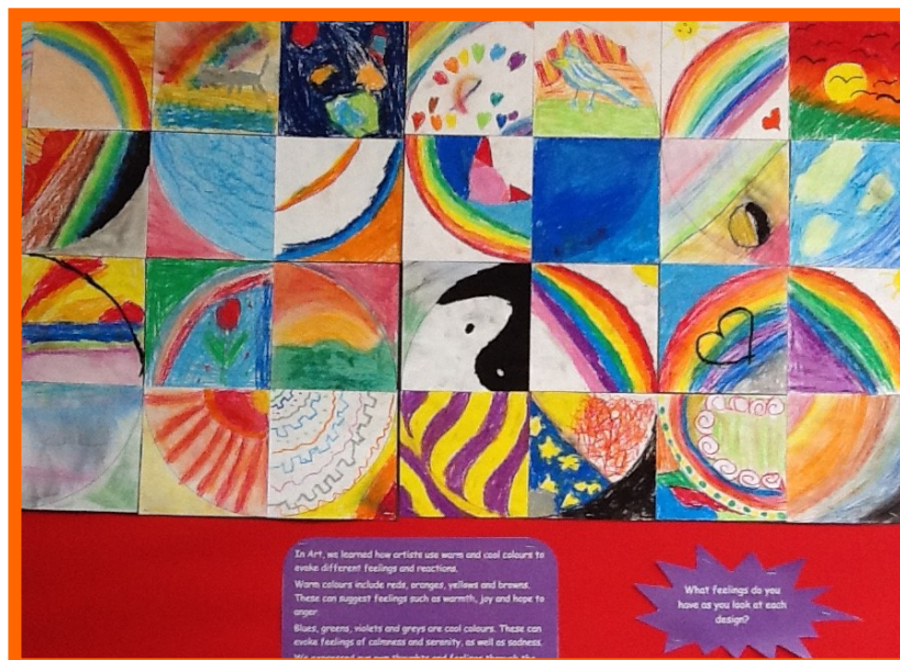
Art Work created by Class 4M